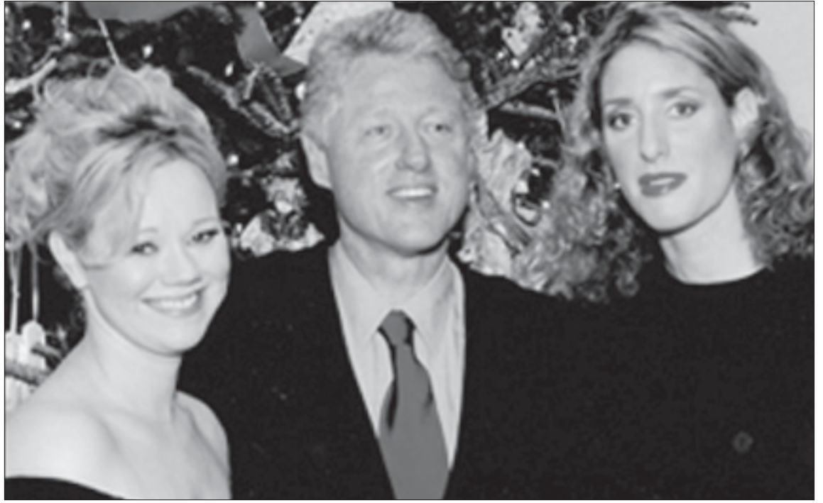
Judy Gold (right) with President Bill Clinton and comedian Caroline Rhea.

"I wasn't? No one told me." More sniffling. "No, really, it's fine." □